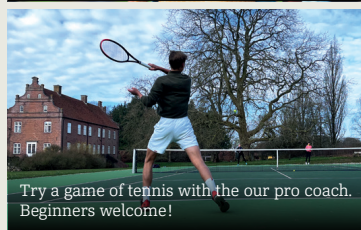
Try a game of tennis with the our pro coach. Beginners welcome!