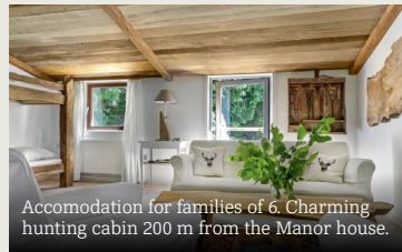
Accommodation for families of 6. Charming hunting cabin 200 m from the Manor house.

Skjoldemose is 30 minutes from H.C. Andersen's hometown, Odense and 10 minutes from Egeskov Castle.